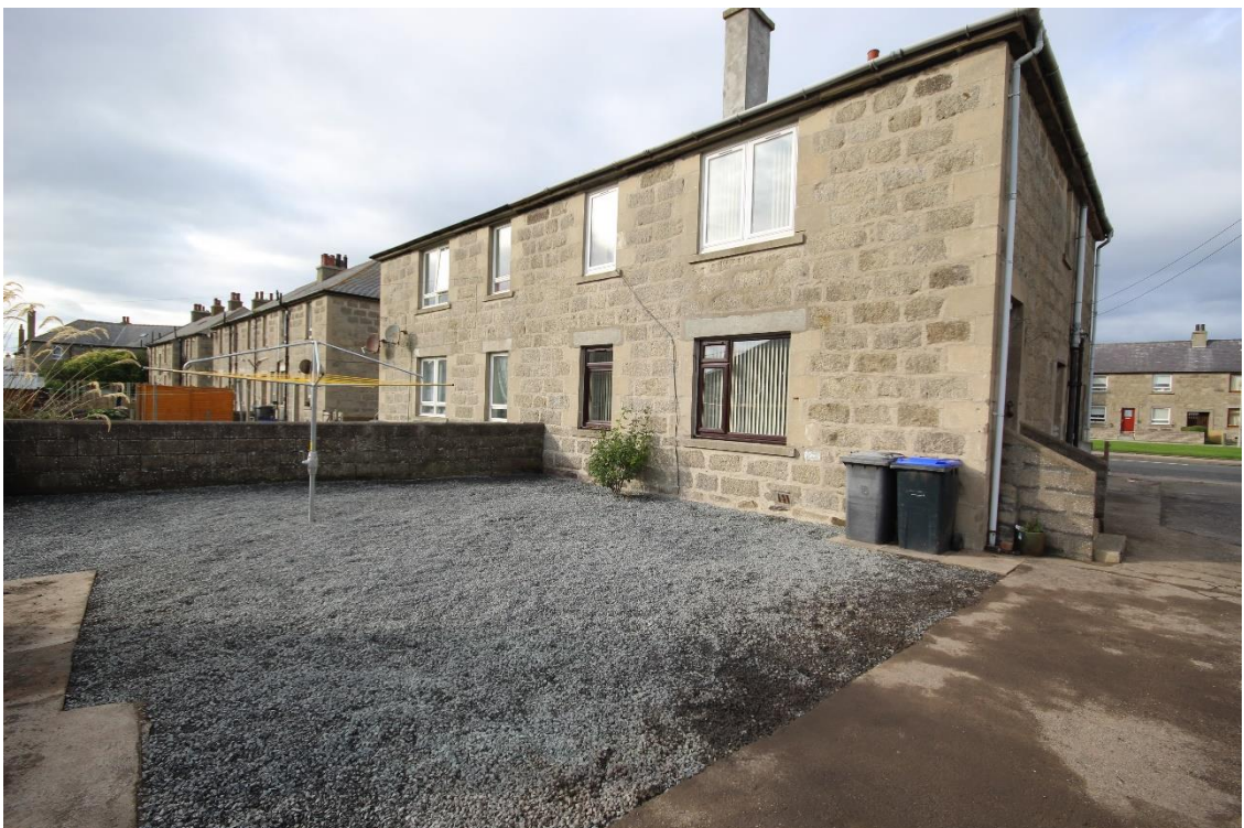
Exclusive area of chipped stone

The front garden belongs to this flat. The rear garden has an exclusive chipped stone area with rotary clothes dryer.