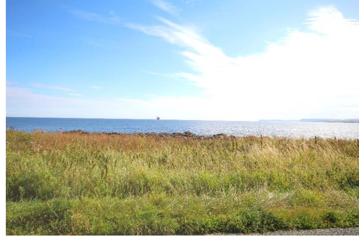
The view across the Moray Firth to the front